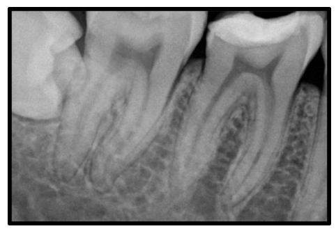
Fig 1: Pre-operative radiograph of 46