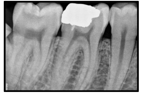
Fig 6: RVG showing silver amalgam restoration in 46

a 66.7% survival rate after 10 years for large, cuspcovered amalgam restorations.<sup>[6]</sup> McDaniel et al., carried out a survey, which revealed that the leading cause of the failure among the cuspal-coverage amalgam restorations was tooth fracture. They assumed that the main reason for the failure was a conservative tooth preparation; too they recommended the replacement of the weak cusps with large amalgam restorations.<sup>[7]</sup> Polymerization shrinkage is a major concern during the placement of the direct, posterior, Resin Based Composite (RBC) restorations. As compared to the similar amalgam restorations, the placement of a direct RBC restoration takes 2.5 times longer due to a complex sequence which is included in the incremental techniques (Roulet, 1997). Patients with para-functional habits are not the ideal candidates for similar treatments. If a conventional, continuous, fast-curing technique is adopted, the bonding