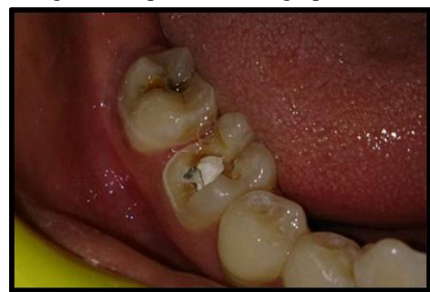
Fig 3: Pin placed in the disto-proximal aspect